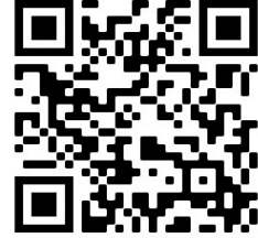
QR Code for Registration